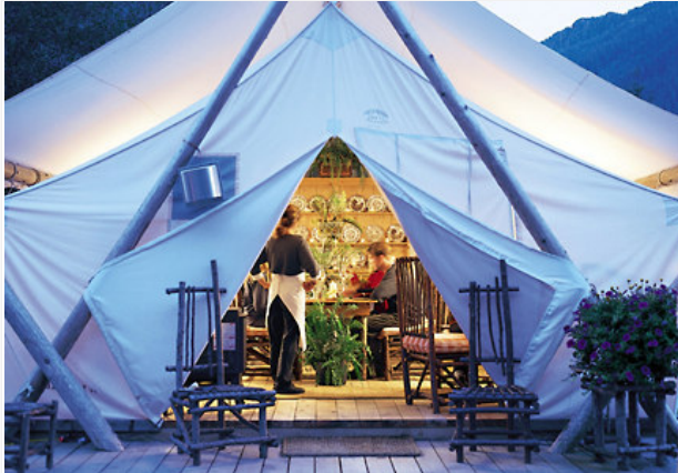
Clayoquot Wilderness Resort, British Columbia, offers elegant outdoor dining.

The hotels on our Stay List 2009 don't just reflect their surroundings—they help define them. What they all have in common is a transcendent vision that goes beyond traditional hotel-keeping. This mindset is what gives these hotels their special sense of place. Make no mistake: You'll sense the vibe at once. Maybe it's the regional architecture that speaks to you. Or a guest room resonating with history. Or local food that not only tastes great but tells a story to boot. After your stay, you'll leave with the kind of insight only soulful places can provide.